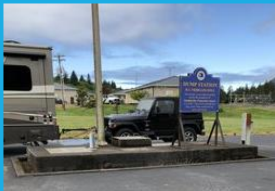
RV Dump Station NBWA Treatment Plant 14000 Tideland Rd, Nehalem OR 97131