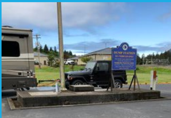
RV Dump Station NBWA Treatment Plant 14000 Tideland Rd, Nehalem OR 97131